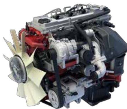
ADVANCED 3L ZD30 DDTi COMMON RAIL DIESEL ENGINE